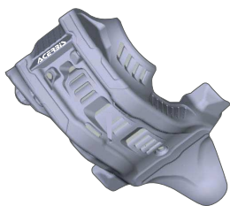
A (1 pcs)